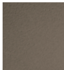
Polished Chrome T23