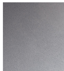
Matte Black Chrome T27