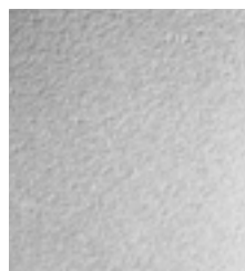
Metal Grey T93